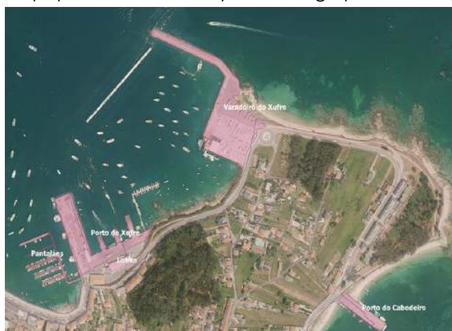
Complexo portuario do Xufre.

The island of Arousa stands out for having the highest income per inhabitant (15,523 euros). It's for above the provincial average (13,203 euros) (Source: IGE). The main productive sectors of the island are the "bateas", flooding structures dedicated to the breeding and exploitation of mussels; followed by shellfishing on foot and by small boats and other minor fishing gear. It should be noted that there are four ports: the Port of Xufre, the Port of Ribeira do Chazo, the Port of Cabodeiro and the Port of Naval, all of them dedicated to the loading and unloading of mussels, clams and other species. In social security affiliation by the productive sector, we see how the primary sector, mainly fishing, occupies the most of the active population. In industry also a large part of companies they are related to the sea sector.