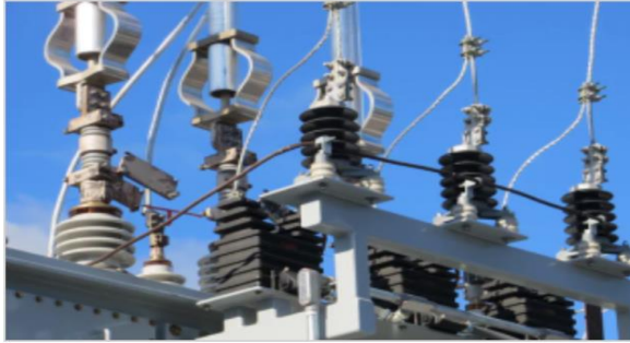
Electricity Grid Policies (Grid- E)