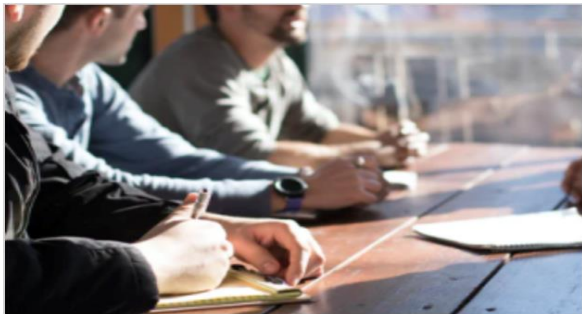
Other clean energy supporting policies