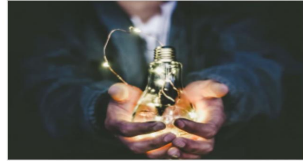
Community Energy Framework