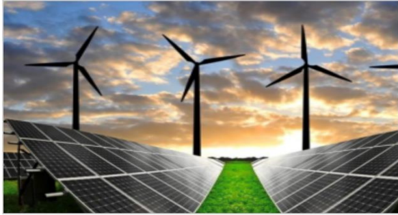
Decarbonisation Action Support