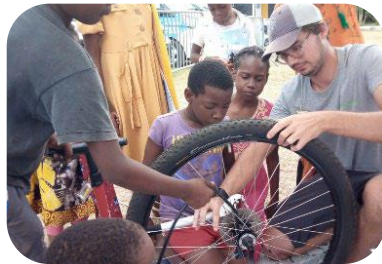
Repair Workshop Community