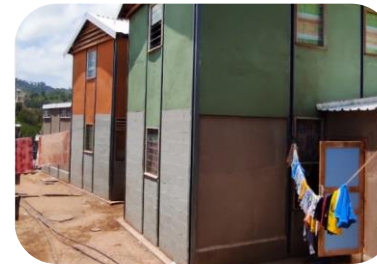
2 x Energy Saving Communities