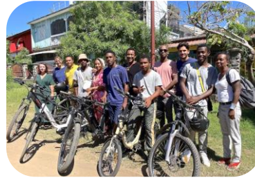
Electric Vehicle Maintenance Community