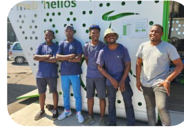
Cooperative Society of Collective Interest