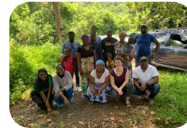
Agricultural Solar Community