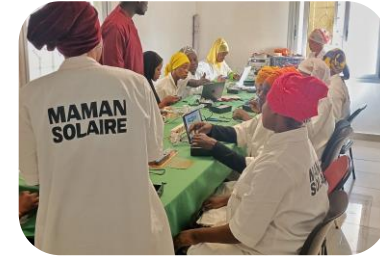
Solar Mama Community