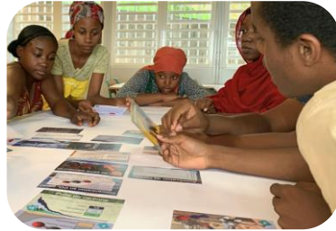
Student Energy Community