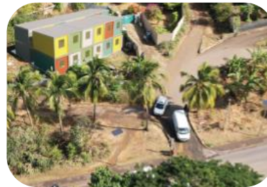
3 x Solar Social Housing Communities